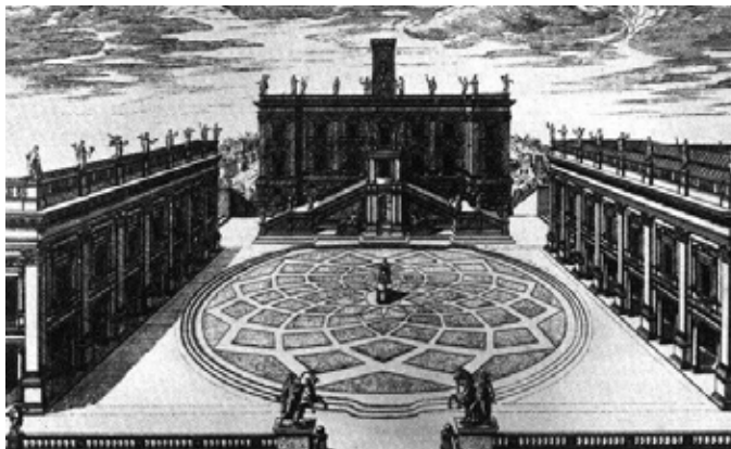
Piazza del Campidoglio architecture of Michelangelo Buonarroti