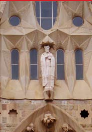
Sagrada Família architecture of Antoni Gaudí